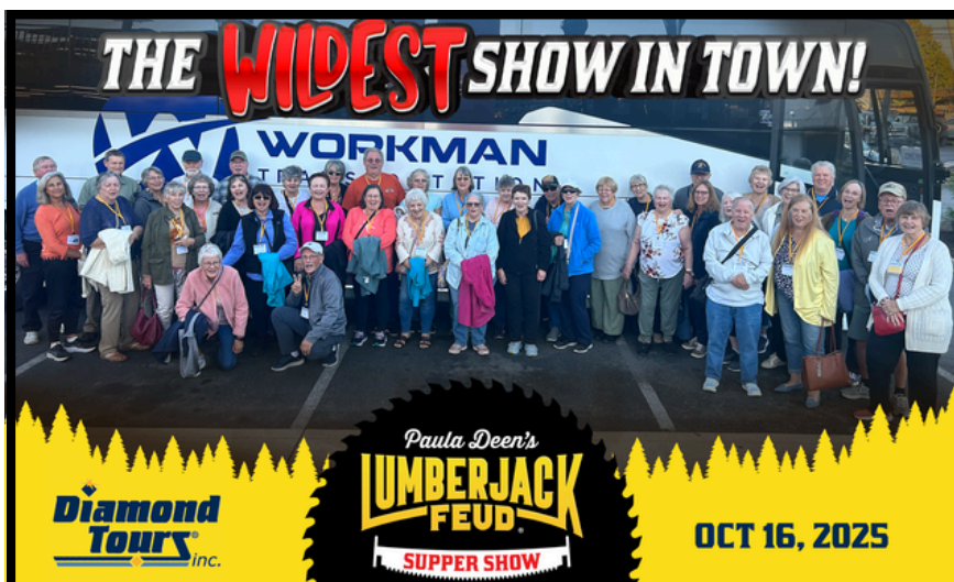
Photo from October 16, 2025 event enjoyed by a large group of attendees.

Multi Day Trip September 27- October 3, Mackinac Island, the quaint Michigan island where no vehicles are allowed. Trip is for 7 days, 6 nights. Tour the island by horse & carriage, cruise the Soo Locks, visit Bronner's Christmas Wonderland, Frankenmuth Bavarian Village and much more, not to mention the plentiful fudge shops. Price $959. Take a $25 discount if paid in full by June 27, 2026. Make the check payable to Diamond Tours and mail to the address above. No money is due until next year. This trip quickly filled up. Please email to be added to the wait list.