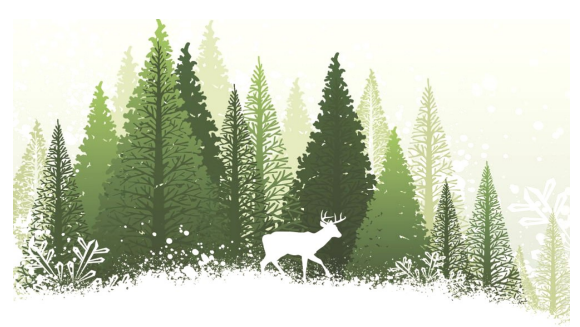
"Cheers to a New Year and a chance to get it right."