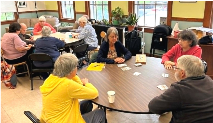
Game Time at the Senior Center