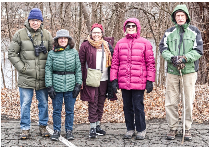
Westhampton COA Hikers at the Easthampton Manhan Trail Hike to Arcadia on a cold December day.

December into mid-January has been mostly cold with little snow, and as I write this, the ground is still mostly bare, with only traces of snow. We had a hike to Arcadia (the Easthampton Manhan Trail Hike) on December 19, and if it warms up a little bit we'll be hiking in the coming week since there's little or no snow on the radar for most of the rest of the month.