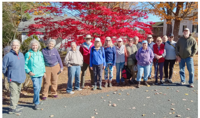
Westhampton COA Hikers at Park Hill Orchard on October 3.

As I write this, the warm weather (and drought!) seems to have extended our hiking season this year. Nonetheless by the time you read this the landscape may be covered with an icy crust - or maybe not! Regardless. We plan to continue to offer hikes as long as we can this fall season – barring any health or other personal reasons that could come up.