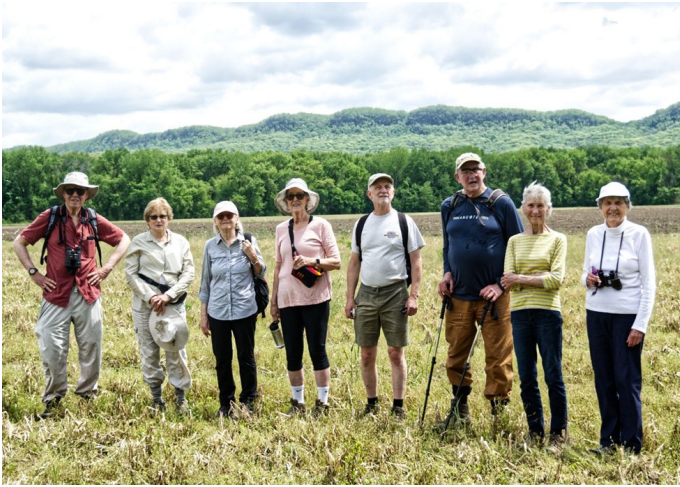
Westhampton COA Hikers at the Northampton Meadows on May 17

So far this past month we've seen the eagle chicks at Arcadia and explored the Northampton Meadows along the Connecticut River. And we've several more new hikes up our sleeves for July and the coming months – as well as plans to revisit some popular previous hikes. So if you enjoy hiking with a great group of people, come join us in our hikes in and around Westhampton by subscribing to our group email list at westhamptoncoahikers@comcast.net . Please note that all group emails are sent as blind copies (BCC) for your safety and privacy.