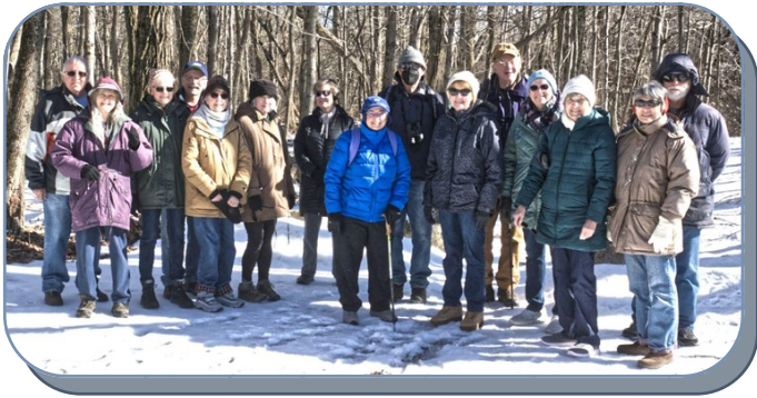
Westhampton COA Hikers at the Four Roads Hike on February 6th.

As I write this, it's snowing again. But the last three snow storms came and went – along with the snow they brought - and we managed to have a hike in early February! Perhaps by the time you read this we'll have done another hike? So whenever the weather gives us a break in March we'll hike. Spring is coming. Stay tuned!