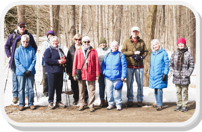
Westhampton COA Hikers at the Four Roads Hike on March 10

It's spring and the snow's gone. By the time you read this we'll have gone on a few hikes exploring the natural beauty of the surrounding wooded areas. We've got many ideas for the upcoming hiking season; new hikes, old hikes, long hikes, short hikes, etc. We'll be exploring long forgotten sections of town and other great new hiking areas nearby. Nonetheless, we would certainly be interested in any suggestions that you'd like to pass long.