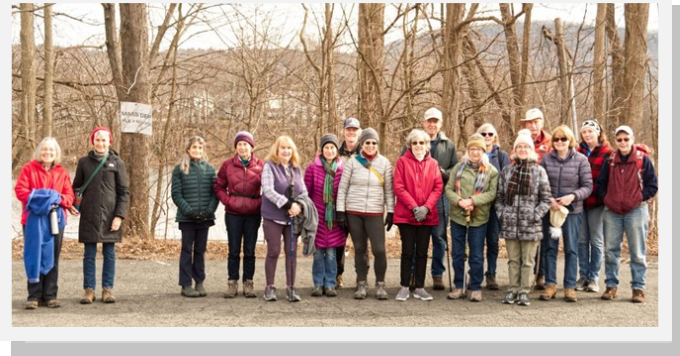
Westhampton COA Hikers at the Manhan Rail Trail & Western Arcadia Sanctuary Trails Hike, February 12.

For anyone interested in joining the Westhampton COA Hikers on our hikes in the local area, email us at westhamptoncoahikers@comcast.net and we will add you to our email hikers list. Please note that all group emails are sent as blind copies (BCC) for your safety and privacy.