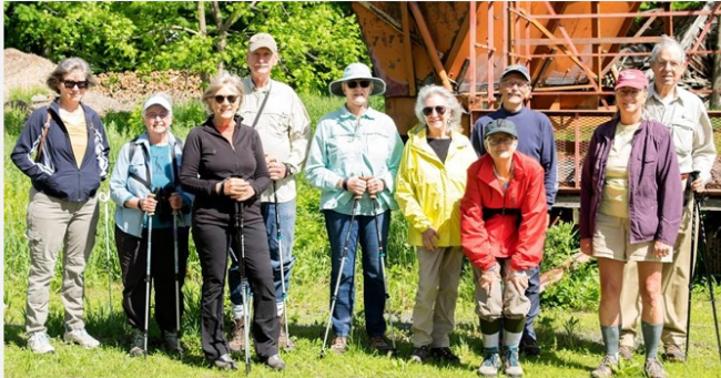
The Westhampton COA Hikers at Parson's (Mayval) Farm on May 24.