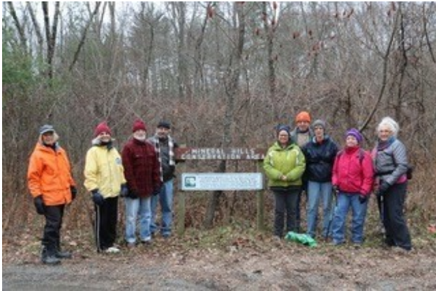
The last hike of the season at Mineral Hills.

We had a wonderful 2017 hiking season. With a postponement here and there, we managed good weather every time. Our own hikers also welcomed many folks who had heard about us through the Gazette and Country Journal. During the winter, some of us will continue to explore new options for the spring. If the weather cooperates, we might even squeeze in something during the winter. Onward! We look forward to seeing you all again in the spring