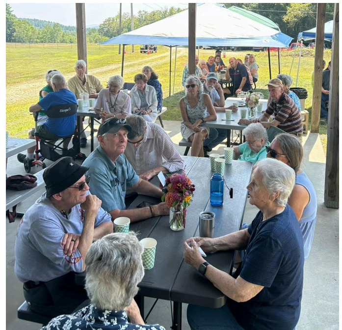
Over 50 of us celebrated Goshen's Golden Seniors on August 12 th at the Tilton Field

We will have snacks and drinks to share and some fun conversation. We will bring our croquet set and play a modified version of the game together. See you there!