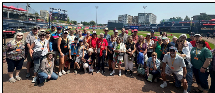
Trip to Polar Park where the group watched the WooSox play on August 3rd in Worcester