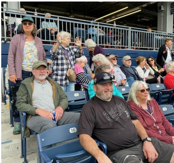
Everyone had a great time at the Woo Sox Game!