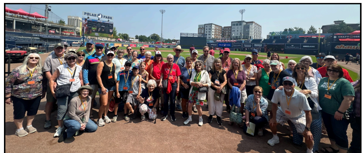
Trip to Polar Park where the group watched the WooSox play on August 3 rd in Worcester