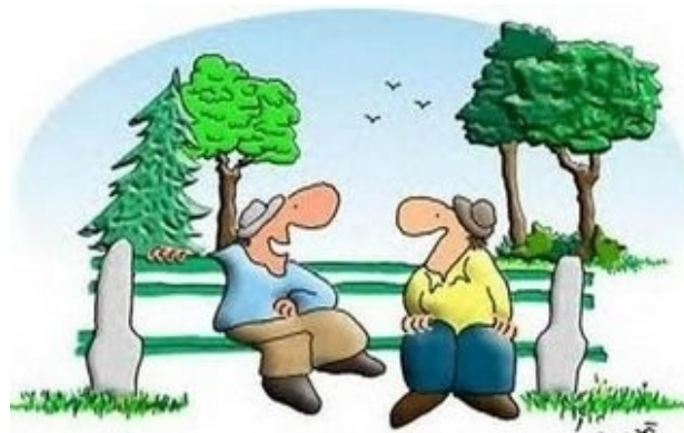
"My doctor told me to avoid any unnecessary stress, so I didn't open his bill."